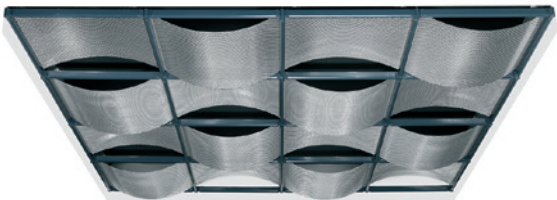
ONDULA Preformed mesh elements are alternating inserted concave/convex into the ceiling system SUSPENSE.